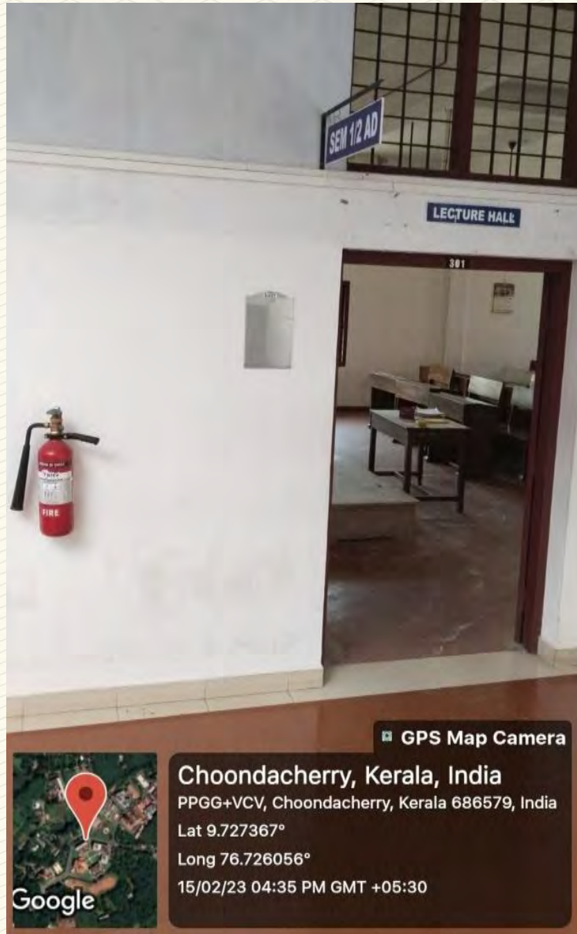
Figure 1: Class Room No .301