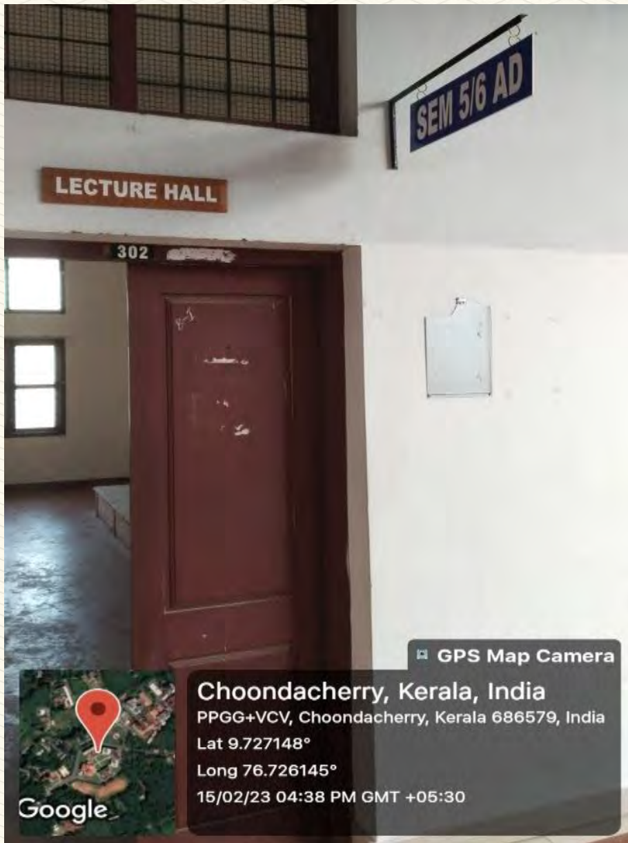
Figure 5: Class Room No.302