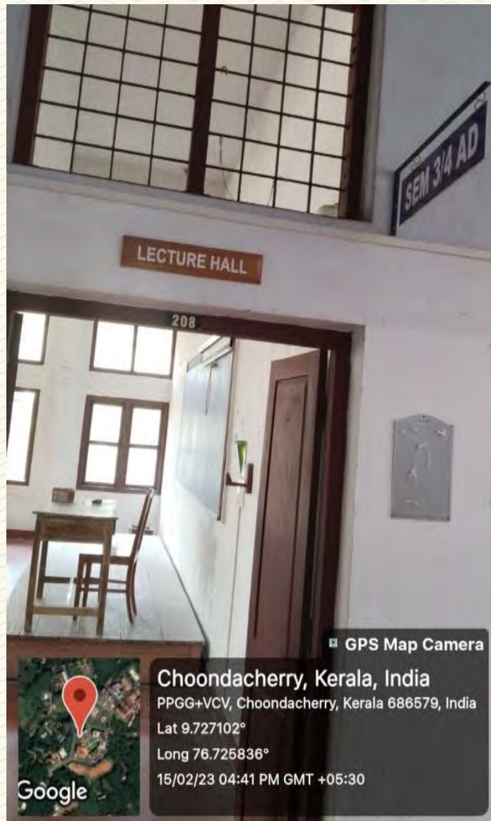
Figure 3: Class Room No. 208