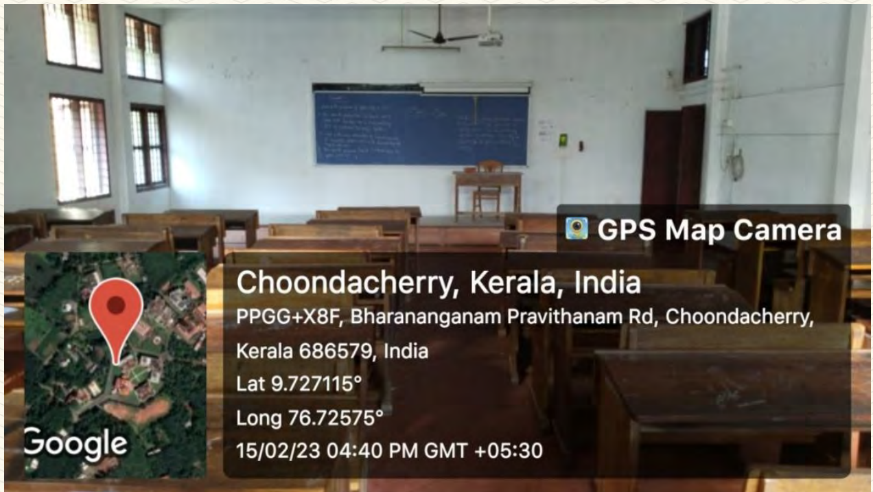
Figure 4: Class Room No. 208