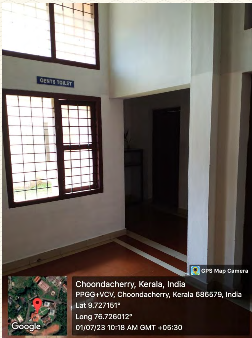
Figure 3: Gents Toilet – SPB 7