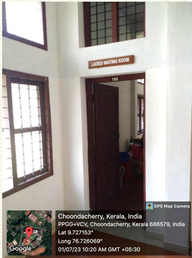
Figure 4: Ladies Waiting Room – SPB 108