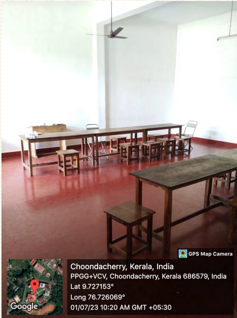
Figure 5: Ladies Waiting Room – SPB 108