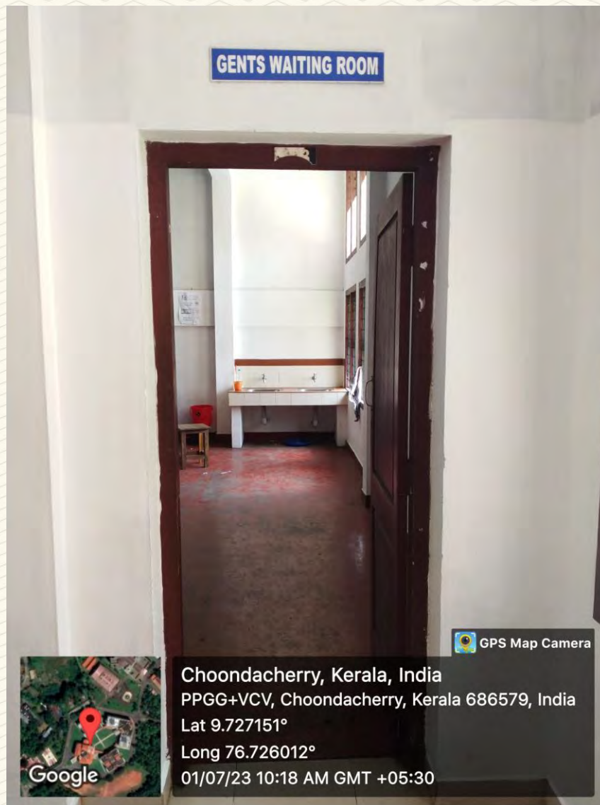
Figure 1: Gents Waiting Room – SPB 103