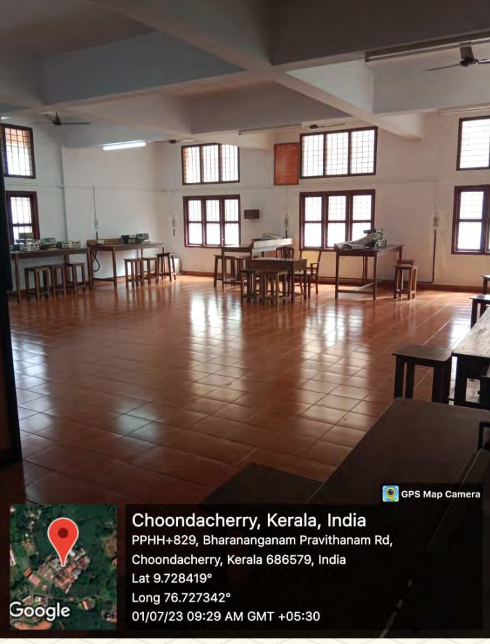
Figure 1: Electronic Circuits Lab