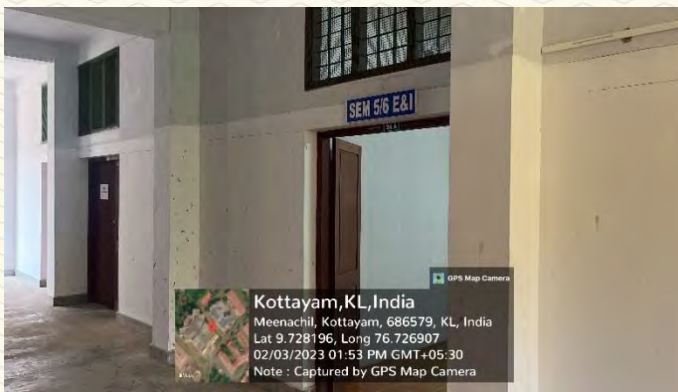
Figure 5: S5/S6 Classroom