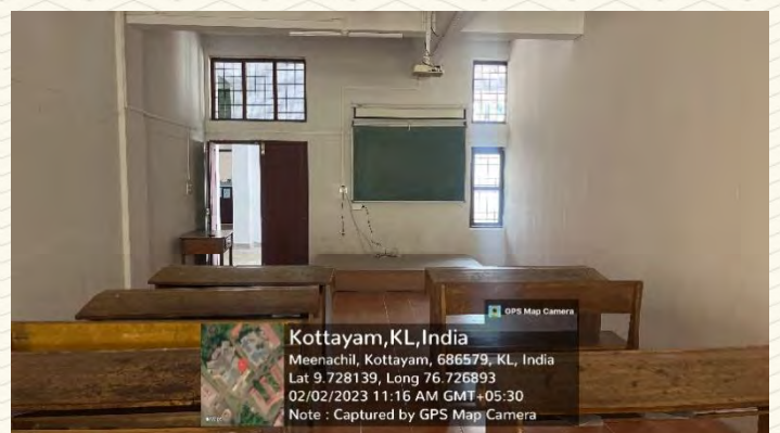
Figure 4: S7/S8 Classroom