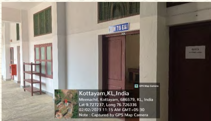
Figure 1: S7/S8 Classroom