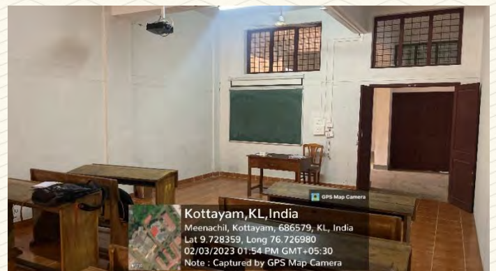
Figure 8: S5/S6 Classroom