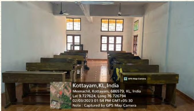
Figure 7: S5/S6 Classroom