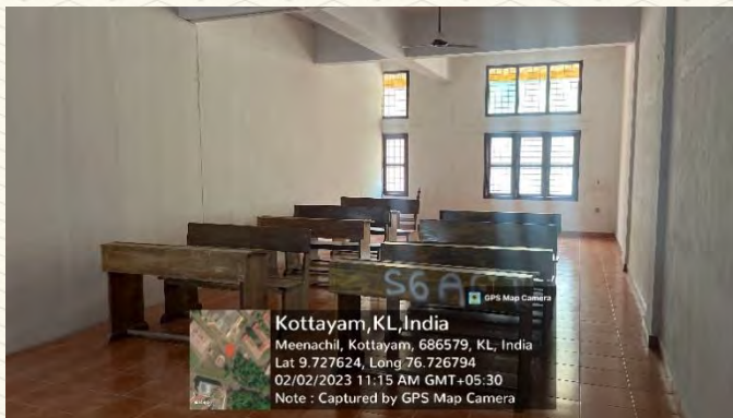
Figure 3: S7/S8 Classroom