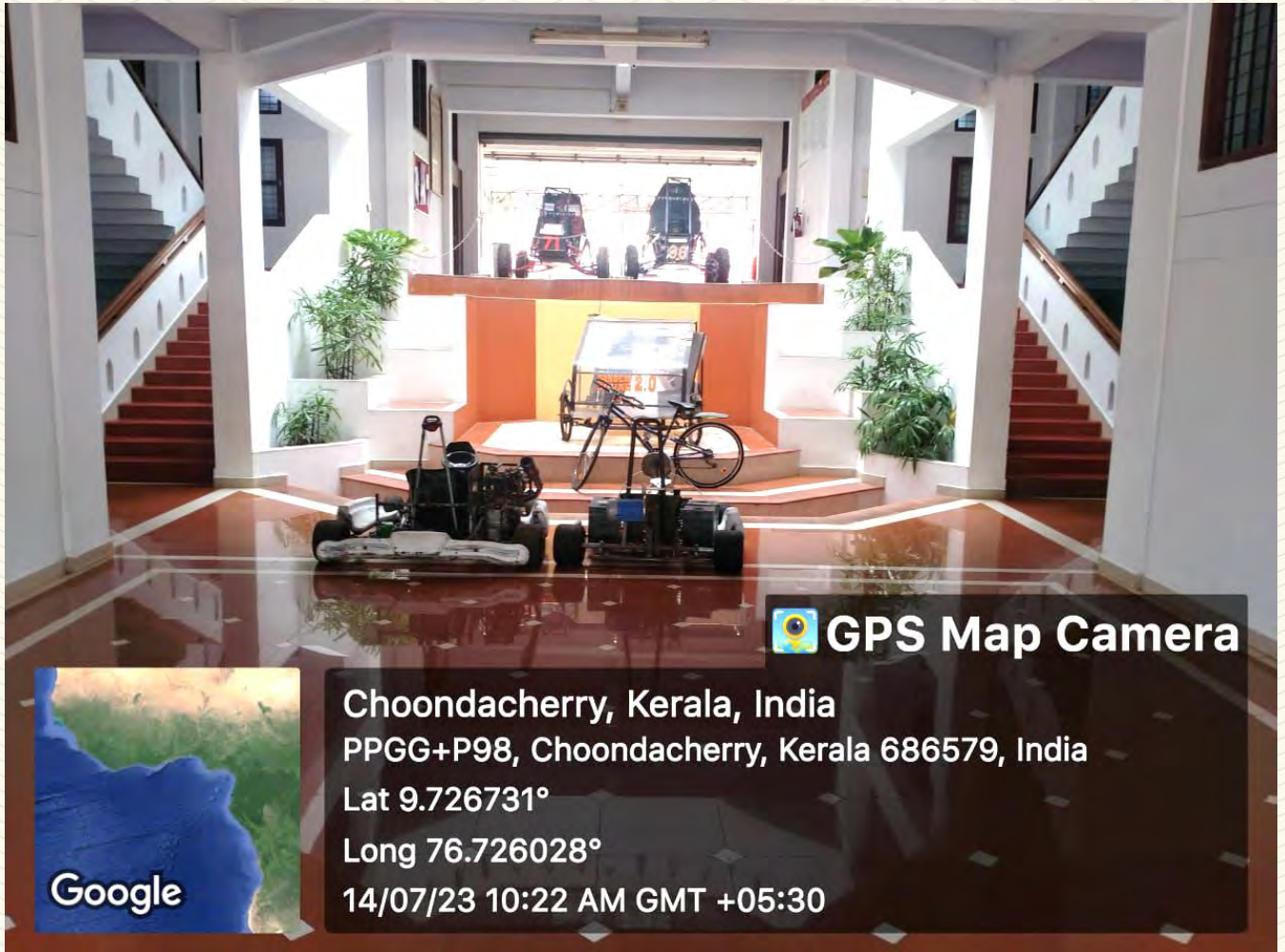
Figure 2: Common Space