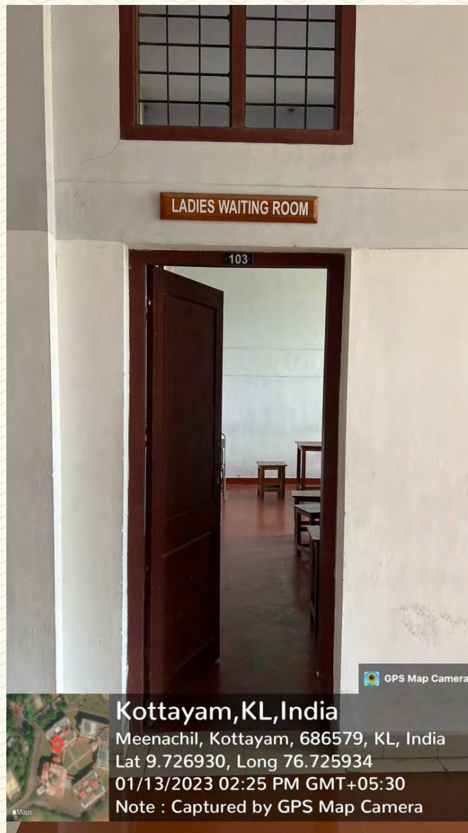
Figure 3: Ladies waiting room