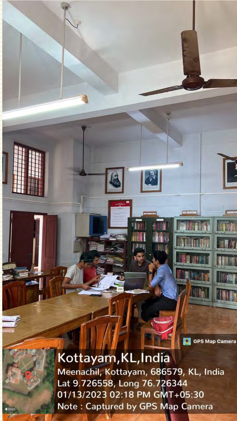
Figure: 11 Department Library