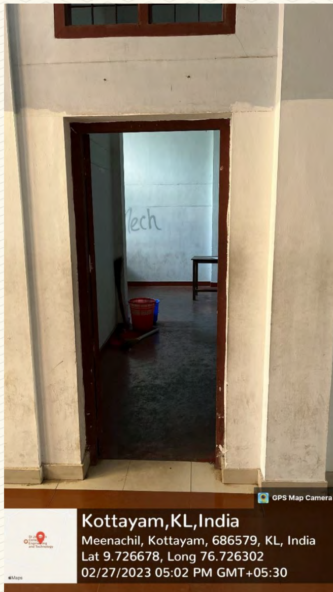
Figure: 6 Gents waiting room