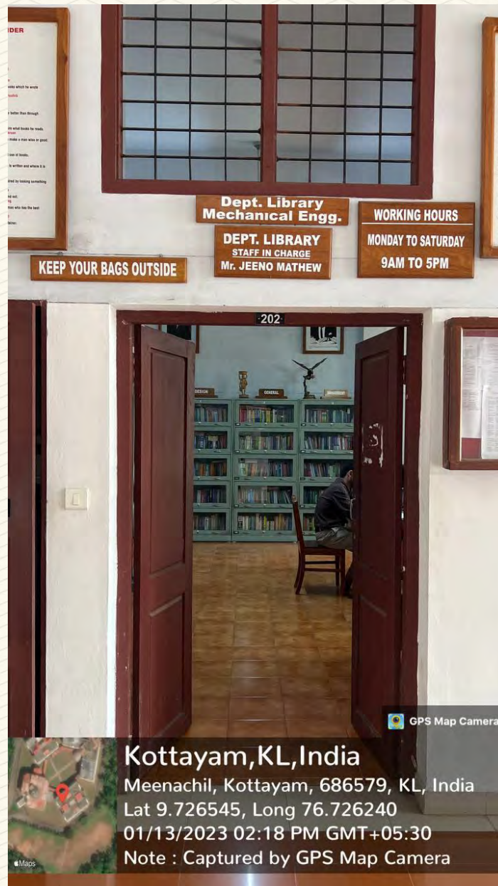
Figure: 9 Department Library