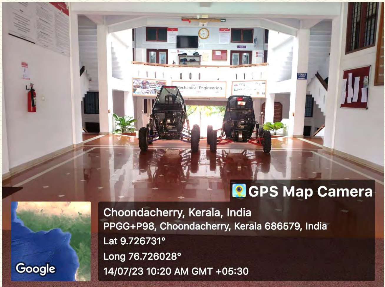
Figure: 1 Common Space