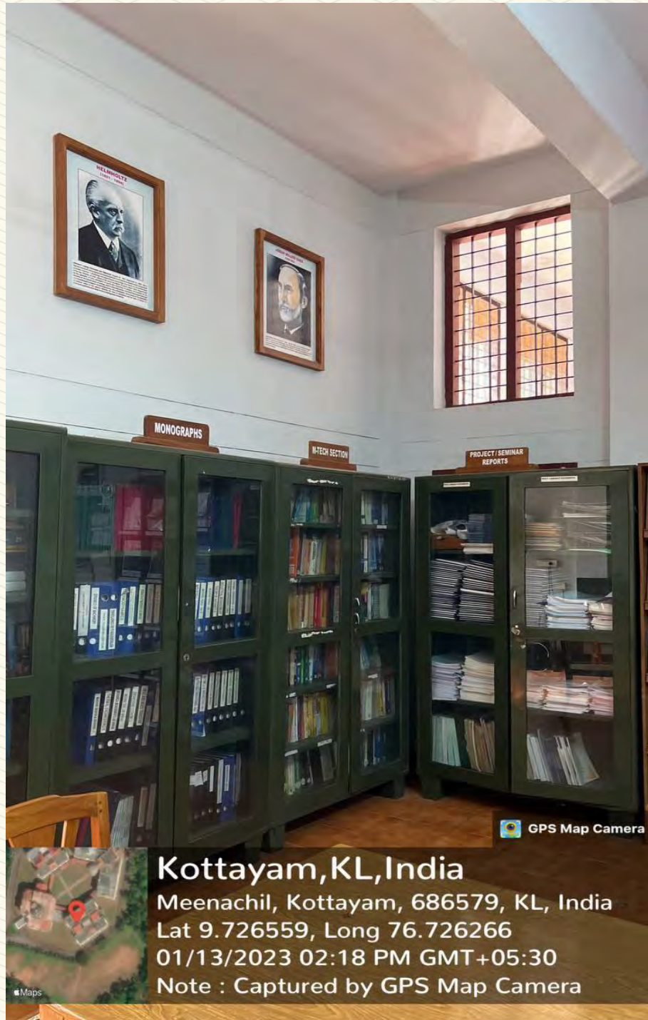
Figure: 10 Department Library