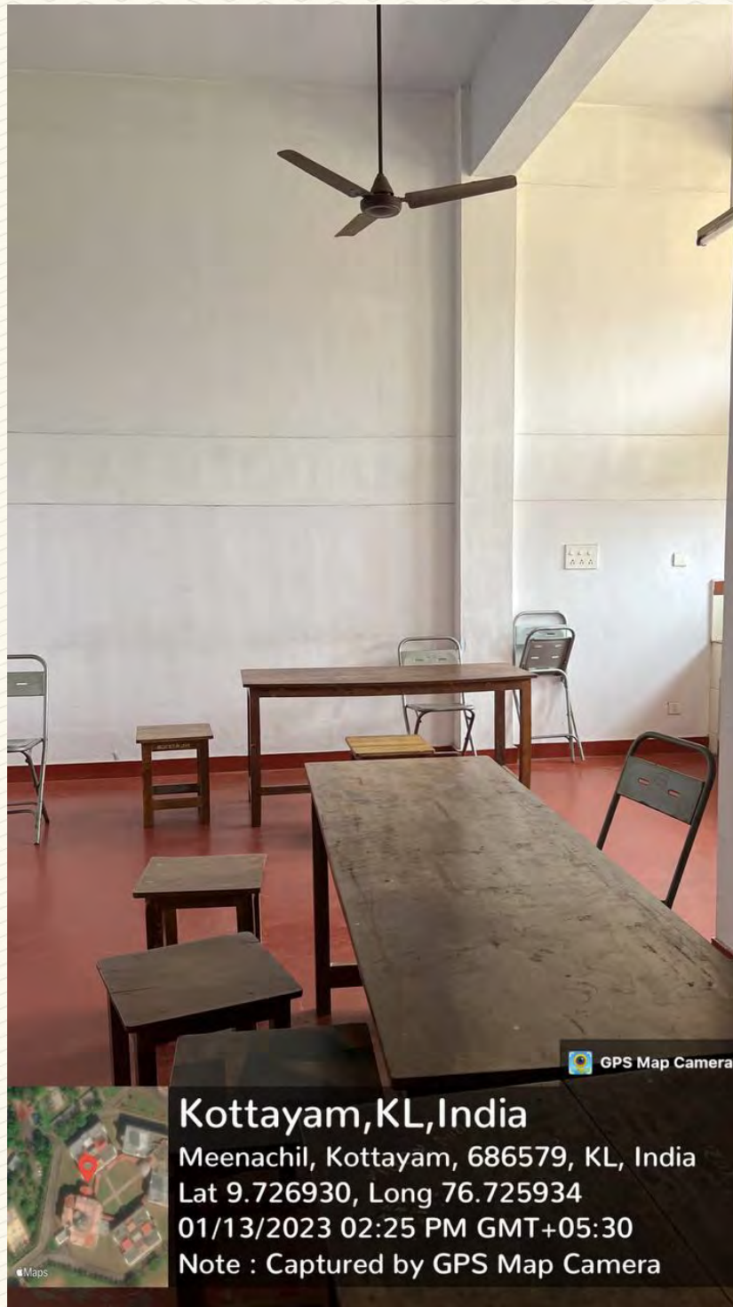
Figure 4: Ladies waiting room