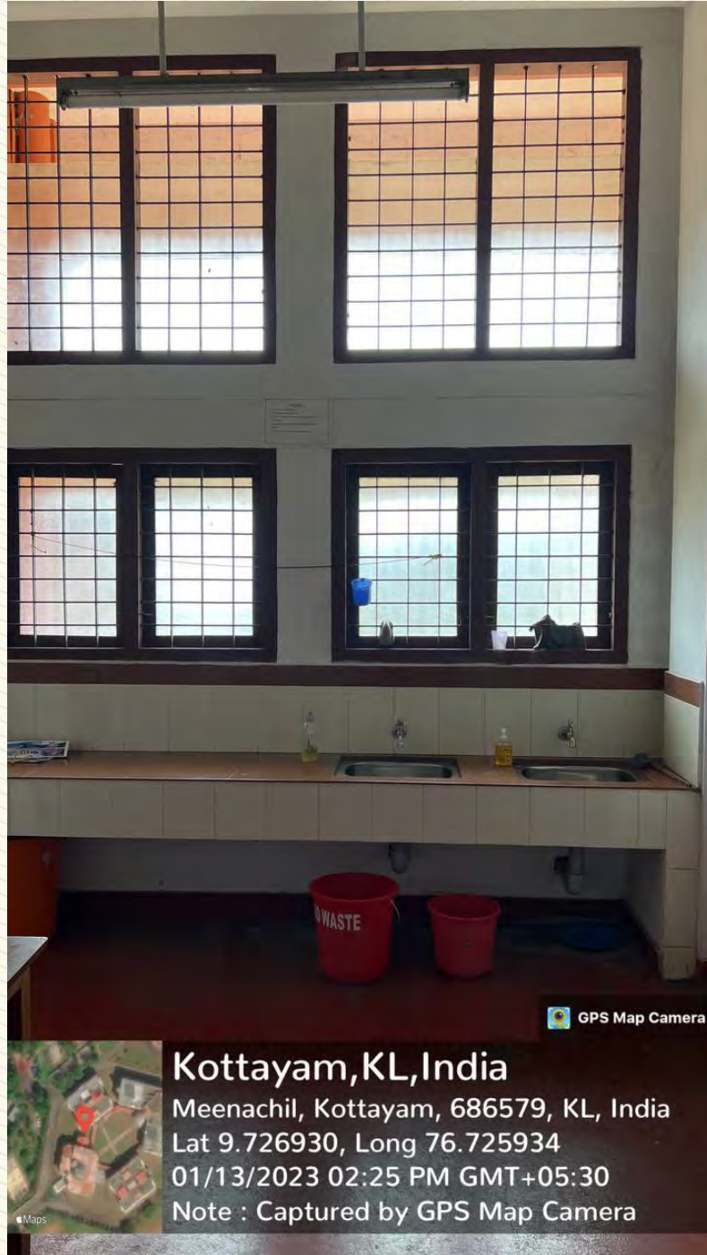
Figure: 5 Ladies waiting room