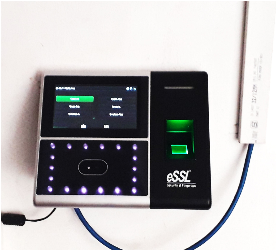
Biometric Attendance System in the Campus integrated with the Cloud ERP Campus Software (Installed in the Campus at various Places for the ease of marking attendance)